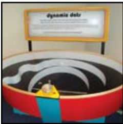
Table includes tops of different shapes and sizes. Experiment and observe the amazing properties of these simple machines.